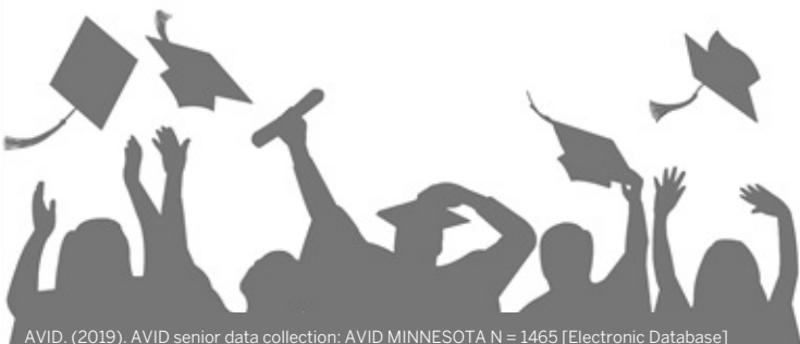
AVID. (2019). AVID senior data collection: AVID MINNESOTA N = 1465 [Electronic Database]

AVID holds ALL students to high expectations.