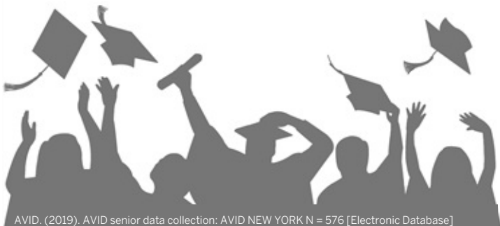
AVID. (2019). AVID senior data collection: AVID NEW YORK N = 576 [Electronic Database]

AVID holds ALL students to high expectations.