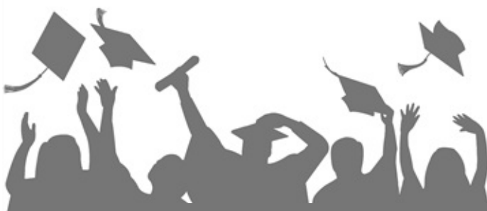
AVID. (2019). AVID senior data collection: AVID OREGON N = 1413 [Electronic Database]

of AVID Oregon Seniors Completed Four-Year College Entrance Requirements