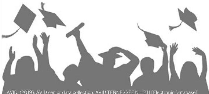
AVID. (2019). AVID senior data collection: AVID TENNESSEE N = 211 [Electronic Database]

AVID holds ALL students to high expectations.